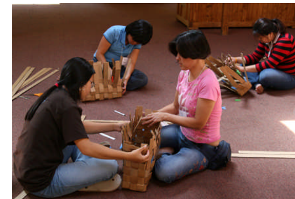
Basket weaving workshop