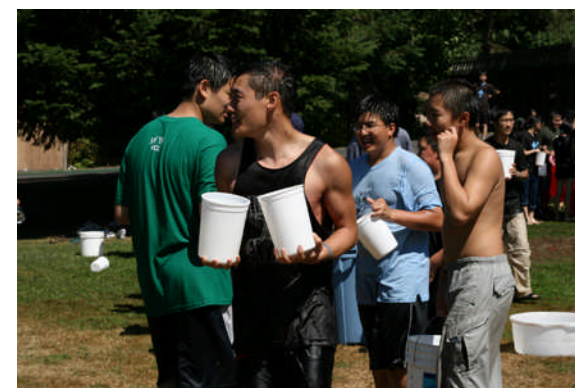
Water fight before leaving camp