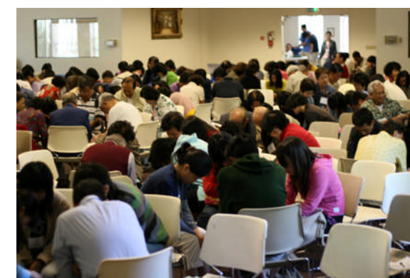
Sweet prayer time during Sat. morning session